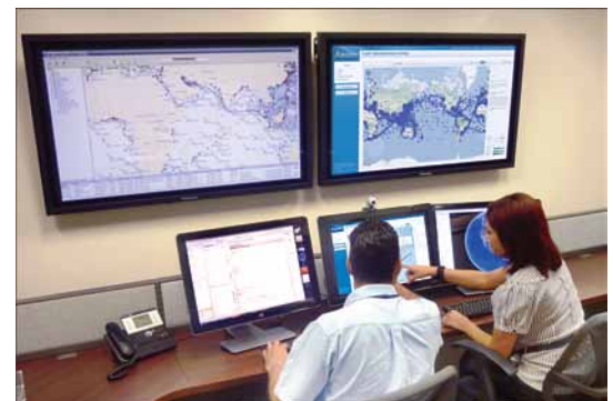
24 x 7 Operations Center