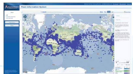
Tracking the world's largest fleet