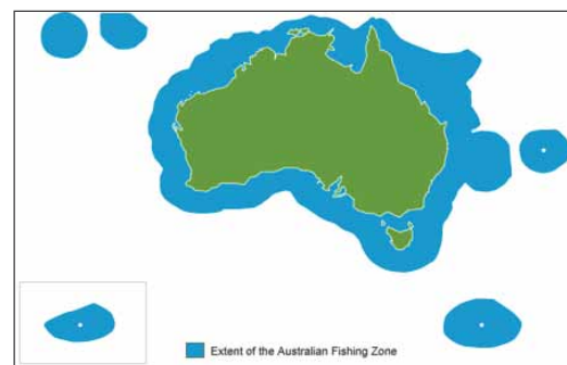
Extent of the Australian fishing zone